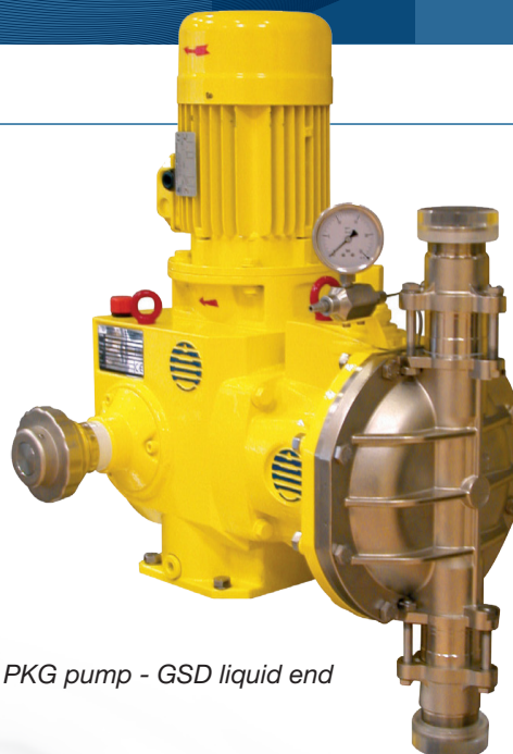
PKG pump - GSD liquid end

The model PKG is designed for high flow rates (2500 L/h – 659 GHP for a simplex configuration) and mid pressure applications (37 bar – 536 psi).