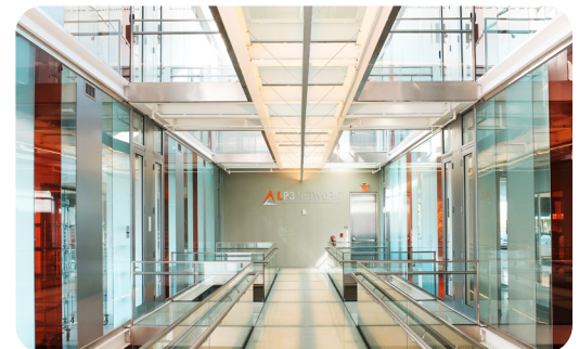
Aventura, FL facility