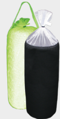
Highly recognizable JORC performance elements