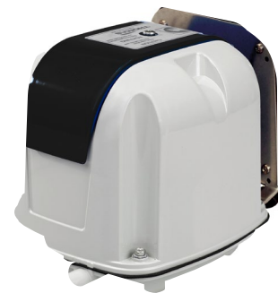
AP Series w/ optional alarm box