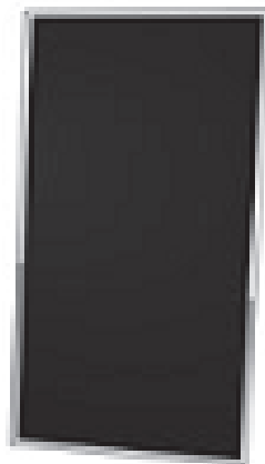
CIGS - Module