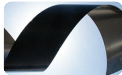
CdTe — Thin Film