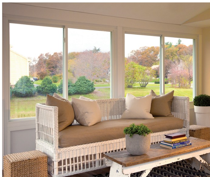
Sliders come in 2- and 3-lite models. 3-lite sliders have a center fixed panel and are available in configurations of 1/3-1/3-1/3 and 1/4-1/2-1/4 .

CLEARSCAPE is also available in sliding windows and picture windows.