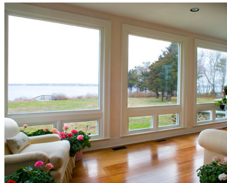
Picture windows are great on their own or combined with double-hung and slider windows for sweeping views and enhanced air circulation.