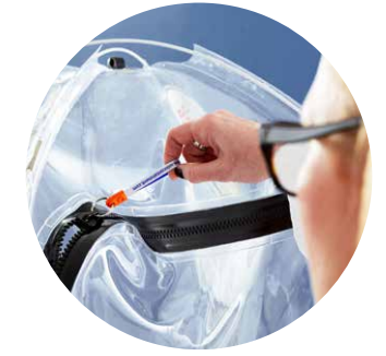
Large gas tight zipper