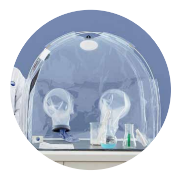
Small footprint means more room for additional laboratory space