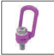
Articulated lifting lugs