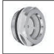
Oil level sight gauge