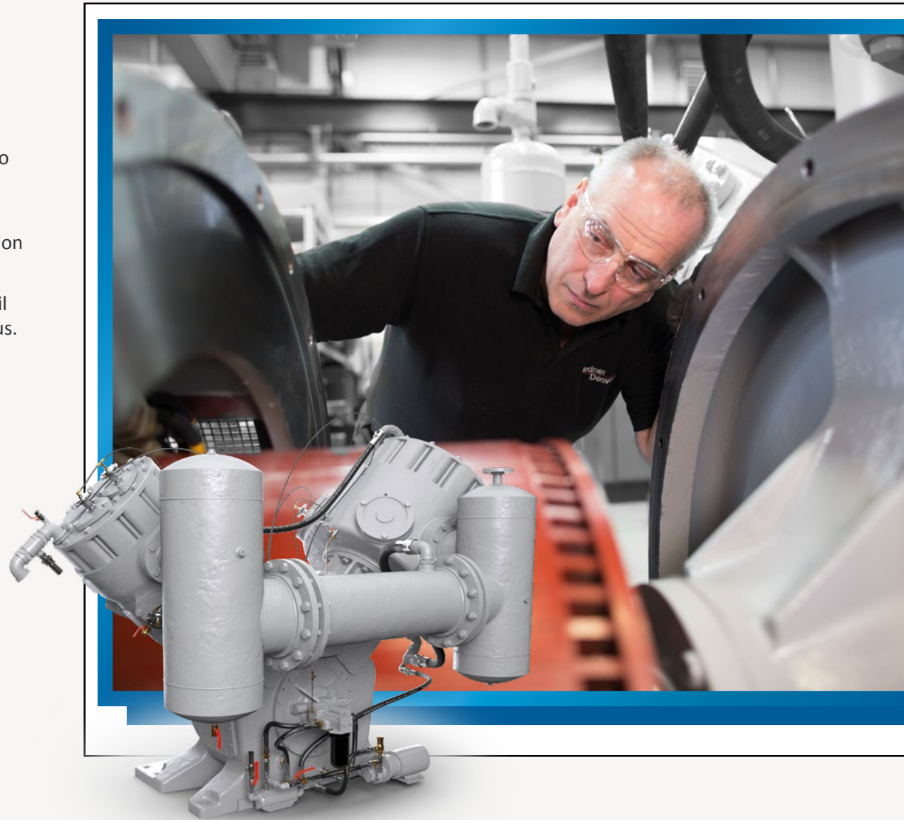
Belliss & Morcom V250-4012N-CO2

OIL FREE AIR AND GAS PROVIDES THE BACKBONE OF TODAY'S INDUSTRY. WITH PROFITABILITY EXPANDING EFFICIENCY AND UPTIME, BELLISS & MORCOM IS ENGINEERED TO PERFORM, WHATEVER THE PRESSURE.