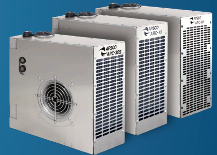
ARC-30S ARC-45 ARC-60

PART OF APSCO'S COMPLETE LINE OF COOLING SYSTEMS