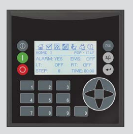
Intuitive system controller with backlit display