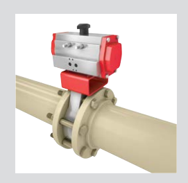
High performance double offset butterfly valve ( > 2 BSPT)