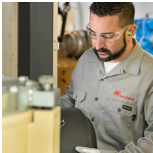
Field Overhaul Services