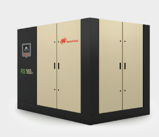
RS 160IE COMPRESSOR

Air compressor use accounts for a significant part of your energy costs. Our design team used advanced computer modeling techniques to create rotary screw compressors that maximize efficiency and airflow, while operating reliably to improve your company's bottom line.