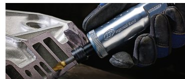
Smoothing Sharp Edges