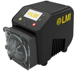
KML & KBL Series

.001 to 158.5 GPH (.06 to 600 l/h) Max: 125 PSI (8.6 Bar)