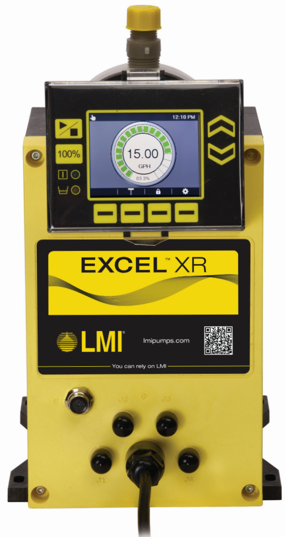
Pictured: Communications model

Selecting the right pump just got easier. No complicated configurations are necessary to find the right pump. With the Manual, Enhanced, and Communications models offered, simply pick the features that fit your needs (see page 6 for a complete list). Our models offer a wide range of functionality including backlit display, multilanguage, and 2-way communication to name only a few.