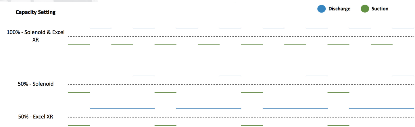
Traditional Solenoid Pump vs EXCEL XR

By using a variable speed drive, the EXCEL XR pump is able to achieve \pm 1\% steady state accuracy over 1000:1 turndown ratio by controlling the stroke profile. As a result, the EXCEL XR provides consistent operation and greater flexibility for handling difficult chemicals such as polymers and other viscous fluids. When the EXCEL XR is activated it is always discharging chemical except during the brief suction stroke. There is no idle time like you see with traditional solenoid pumps at lower capacity settings.